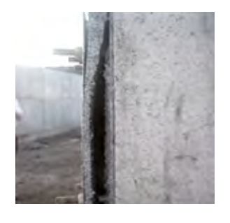
Reinforced concrete wall protected by Havel Lite® SAS

(Concrete wall remains intact because of the front-lying aluminum foam